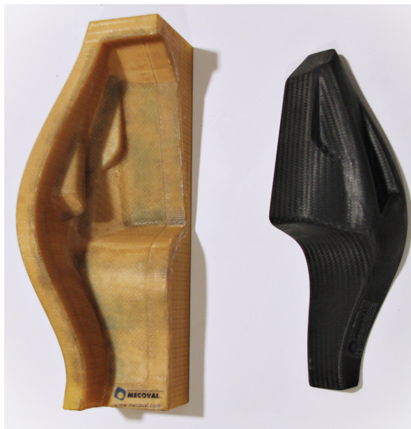
3D printed composite layup tool produced in ULTEM™ 9085 resin, alongside the final carbon-fiber part for use in Formula One racing.

The Fortus 450mc is also employed to produce sacrificial tools using an advanced soluble material, ST-130, to make composite parts with complex geometries. The carbon fiber composite material is wrapped around the mold, and once cured, the internal sacrificial core is washed away leaving the final composite part. Enguix explains, "We were recently tasked by one of our automotive customers to produce a complex duct in carbon fiber. Using our traditional CNC process, this would have taken two weeks and been a very costly exercise. Using the Fortus 450mc, we were able to print the soluble tool and have a final carbon-fiber part in our hands within days, and at a fraction of the cost."